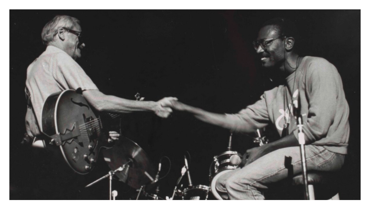
Toots and Bobby McFerrin

During this conference, Hugues Warin will propose an analysis of the links between Toots' aesthetic choices and the socio-political contexts in which he lived. As the lecture is part of a nocturne, you can visit the exhibition until 10 p.m.