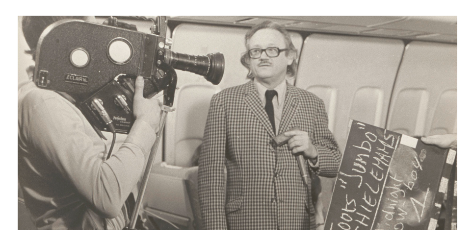
Toots for a promotional film for "Midnight Cowboy"

Discover these components in Toots' worlds: his own compositions, the jazz styles he played, Latin American music, the film and advertising world and the social dimension within jazz.