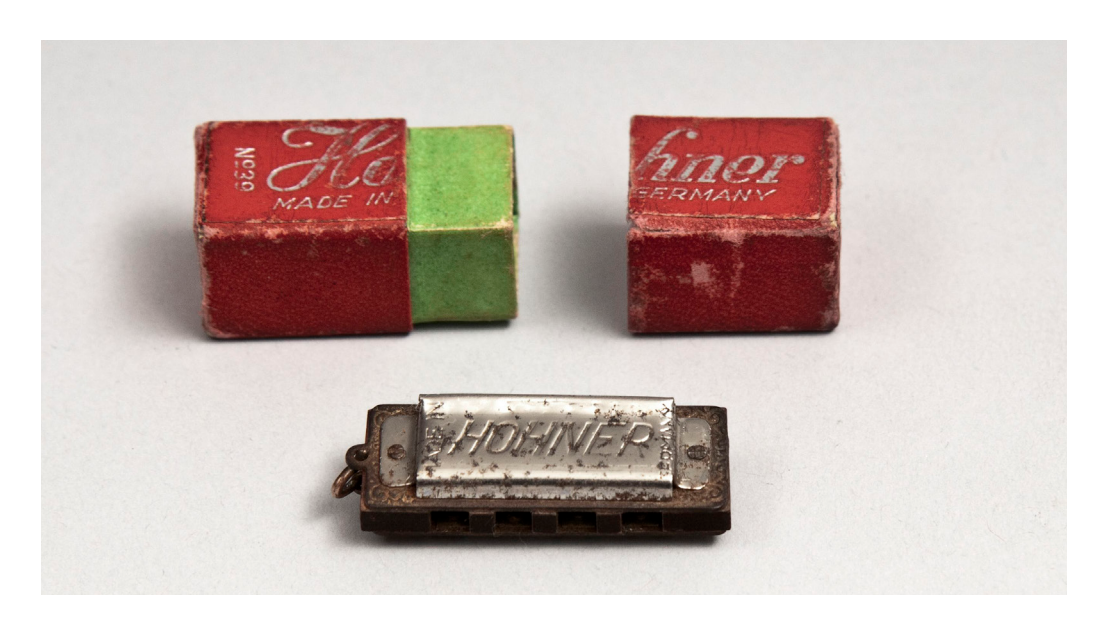
Harmonica Little Lady

Géry Dumoulin will take you on a tour of the world of the harmonica and its family: free-reed instruments (accordion, melodica, harmonium, etc.). All the secrets surrounding this family of instruments will soon be revealed to you! As the lecture is part of a nocturne, you can visit the exhibition until 10 p.m.